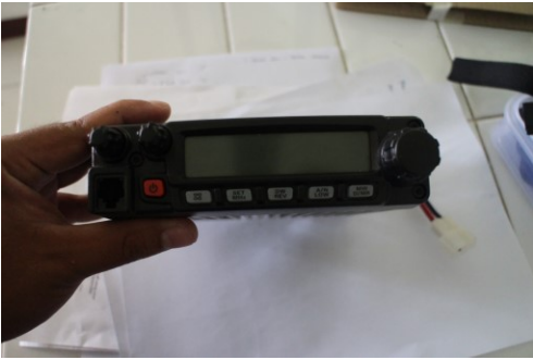
Figure 4 Radio receiver Yaetsu FT-1802 M/E

The next step was to coordinate the member of team researchers, also with LIPI and RCS (Raptor Conservation Society) to conduct stabilization team through theoretical training and simulation in the Semarang State University area (Fifure 5), Mangkang Zoo, and then directly in the field study on Mount Ungaran.