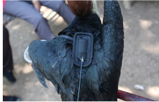
Figure 6 Radio telemetri backpack attachment method

The test results showed that a transmitter attachment on the backpack has a strong resistance. So that even the birds had several times tried to pull, strong enough transmitter attached and not damaged. After one week simulation, originally a bird disturbed so that it always seeks probe backs and wings to try to take it off, but the next day had not demonstrated such behavior.