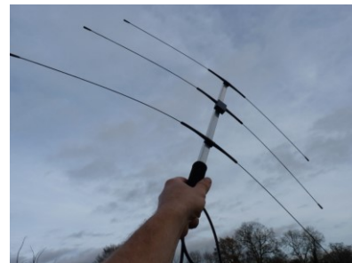
Figure 3 Antenna Yagi 151 MHz

The antennas type that we used also Whip type, while receivers are used Yaetsu mkll the FT 690 mhz frequency 150000-151999 MHz (Figure 3 and 4).