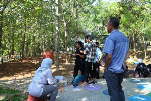
Figure 5 Simulation radio transmitter in SSU

The next step was to coordinate the member of team researchers, also with LIPI and RCS (Raptor Conservation Society) to conduct stabilization team through theoretical training and simulation in the Semarang State University area (Fifure 5), Mangkang Zoo, and then directly in the field study on Mount Ungaran.