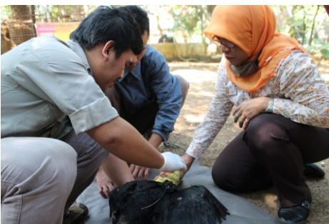
Figure 5 To setting radio transmitter on backpack

Trial installation of the transmitter have been done on Wreathed Hornbill species in Mangkang Zoo. We decide to put the transmitter placed in the backpack of the bird for one week by using the jacket coat (Figure 5 and 6).